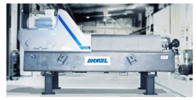
ANDRITZ decanter centrifuge F

While you are saving time in production, there is no need to lose time during maintenance! The in-line design of our ANDRITZ decanter centrifuge F allows easy dismantling (requiring only basic lifting equipment and an operator). This configuration provides cost savings in maintenance and handling.